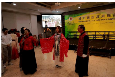
Traditional Chinese Costumes (Feb 24, 2017)