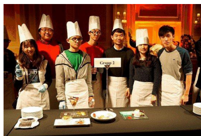
Food and Culture (Mar 1, 2017)