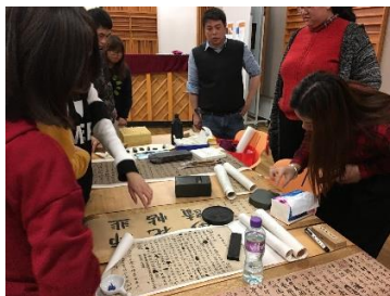
Calligraphy Workshop (Feb 21, 2017)