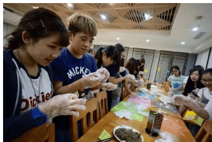
Mid-Autumn Celebration (Sept 14, 2016)

They are College-wide student activities organized by HA and working groups under HA. HA will also organize students to attend inter-collegiate competitions.