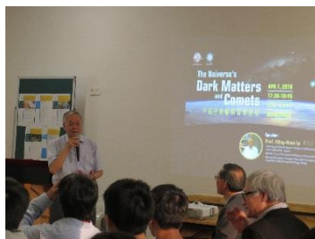
Dark Matters and Comets Seminar (Apr 7, 2016)