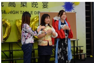
Traditional Chinese Etiquette (Sept 20, 2016)