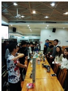
Hand-Made Coffee Workshop (Feb 22, 2017)