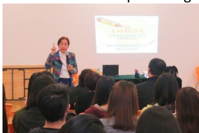
Five Languages of Love (Mar 30, 2016)

They are delivered by well-known scholars and experts. They help students broaden knowledge frontiers, enhance personal growth, enrich cultural experience and develop learning skills.