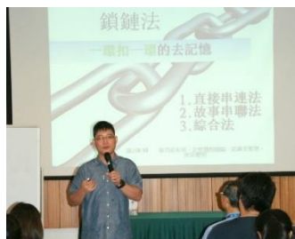
Super Memory Workshop (Oct 31, 2016)