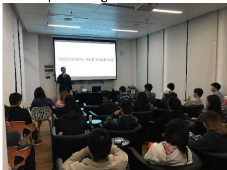
Movie Appreciation, "The Shawshank Redemption" (Feb 21, 2017)

They are small group activities organized by RT & RA of each floor to build friendship bonding.