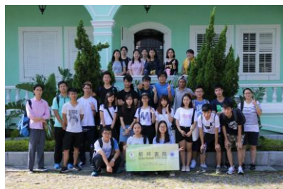
Cultural Tour (Sept 23, 2017)

These are College-wide student activities organized by HA and working groups under HA. HA will also organize students to attend inter-collegiate competitions.