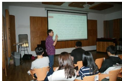
中國文化精華之“龍” (Jan. 31, 2018)