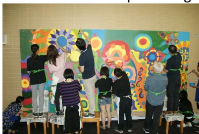
Circle Painting (Sep. 21, 2017)

They are delivered by well-known scholars and experts. They help students broaden knowledge frontiers, enhance personal growth, enrich cultural experience and develop learning skills.