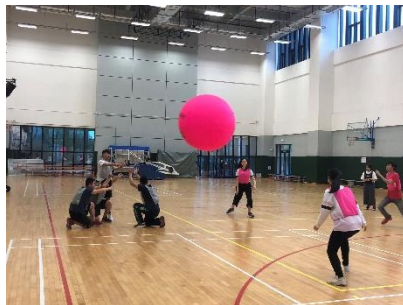
Kin-ball Workshop (Apr 21, 2018)