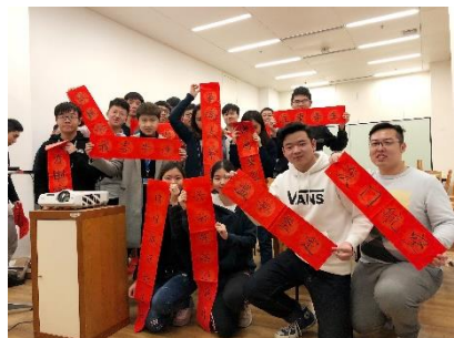
Spring couplets workshop (Jan 28, 2018)

These are small group activities organized by RT & RA of each floor to foster friendship and enhance bonding.