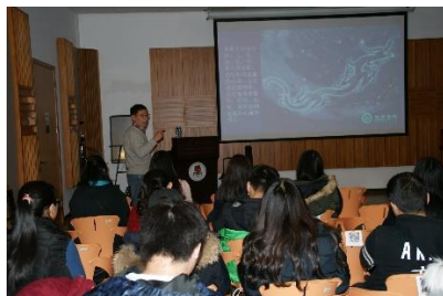
中國文化精華之“二十四節氣” (Apr. 11, 2018)