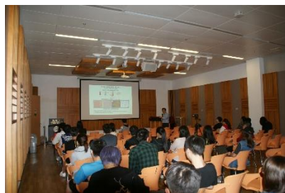
Talk on "stem cells" (Nov. 14, 2017)