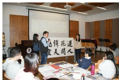
中國文化精華之“書法” (Jan. 24, 2018)