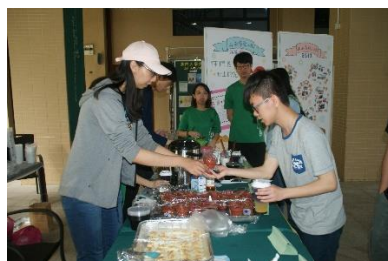
Charity bazaar (Apr. 12, 2018)