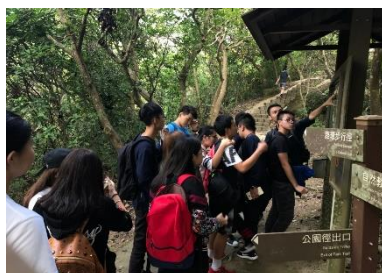
Hiking (Nov 18, 2017)