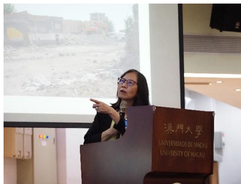
知名記者張翠容講座 “另一個土耳其” (Mar. 9, 2023)