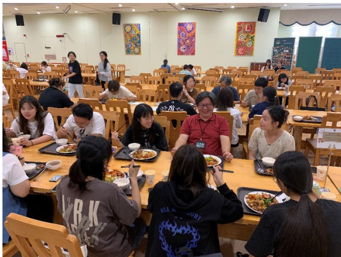
Lunch with professors