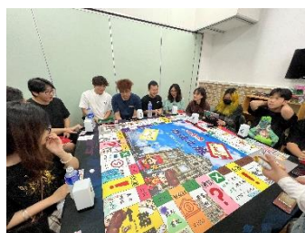
Board Game Room 紙牌屋