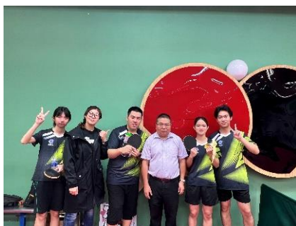
Table Tennis Team 乒乓球隊