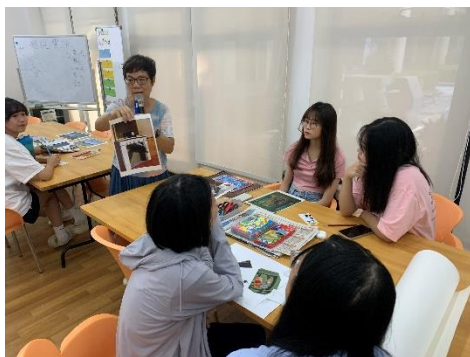
“捕捉創意思考力”證書課程 (Sep., 2023)