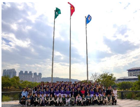
校園開放日升旗儀式 (Jan. 14, 2024)

They are delivered by well-known scholars and experts. They help students broaden knowledge frontiers, enhance personal growth, enrich cultural experience and develop learning skills. 由書院教學人員主導舉辦的活動，幫助學生開拓視野、豐富文化體驗、發展學習技能、實現個人成長。