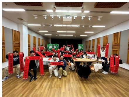
迎新春 寫對聯 (Jan. 28, 2024)