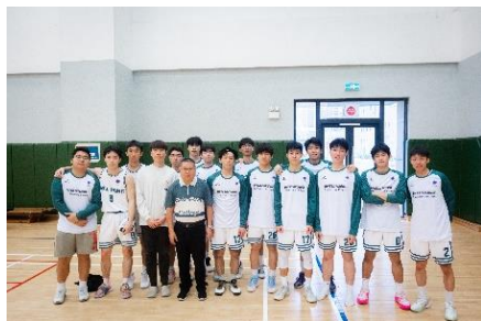
Basketball Team 籃球隊