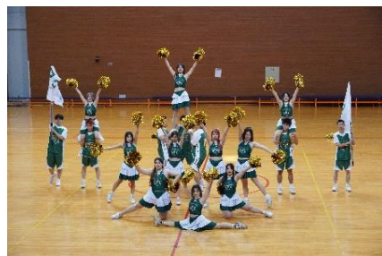
Cheerleading Team 啦啦隊