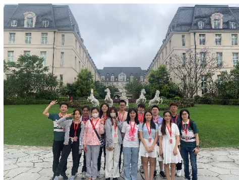
參觀華為 (Apr. 22, 2023)