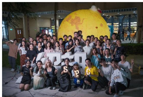
中秋遊園會 (Sep. 28, 2023)