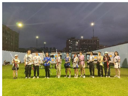
射箭工作坊 (Apr. 13, 2024)