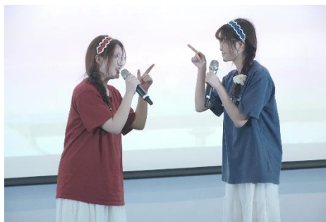
Final Festival (Apr. 19, 2024)