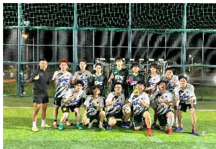
Football Team 足球隊