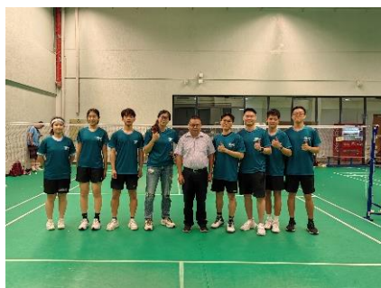
Badminton Team 羽毛球隊