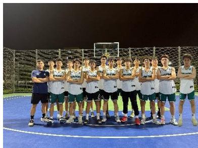
Basketball Team 籃球隊