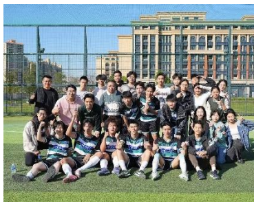
Football Team 足球隊