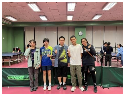
Table Tennis Team 乒乓球隊