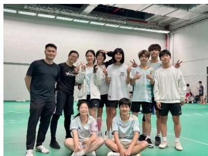
Badminton Team 羽毛球隊