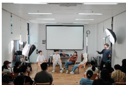
SPC Studio SPC 媒體工作室