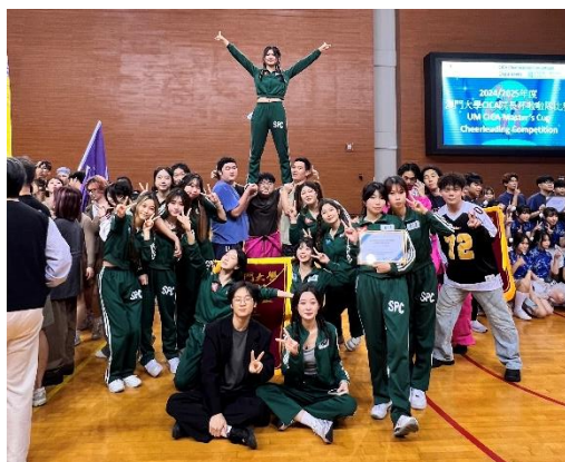
Cheerleading Team 啦啦隊